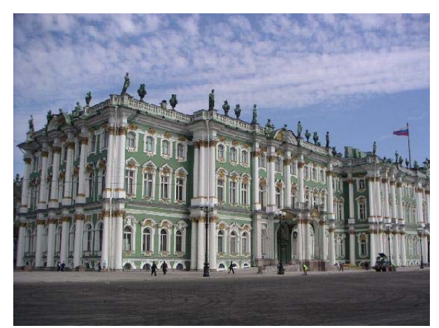
The Hermitage Museum in St. Petersburg.

3. Host Microbiota Regulation Disturbances & Human "Diseases of Civilization" (AIDS; Avian Influenza Virus Infection; Cancer, Healthcare-associated Infections; Drug Disease)